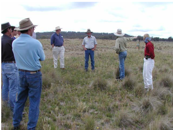
The Cicerone Board inspecting a pasture on farmlet C in November 2002