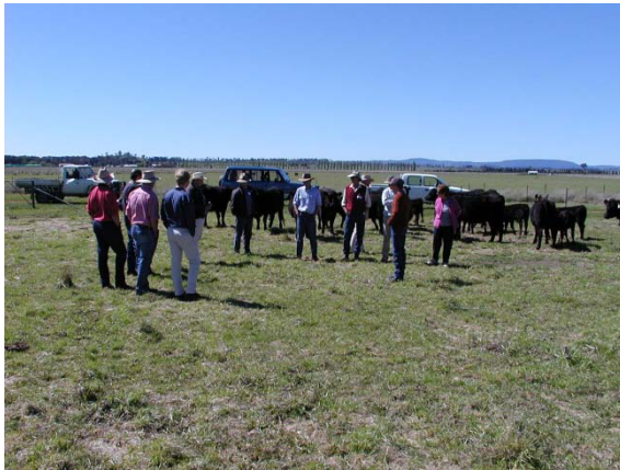
An early field day with cattle in October 2001