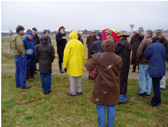
Field day on Better Fertiliser Decisions in September 2004