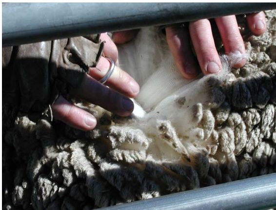
Taking a mid-side wool sample in July 2004