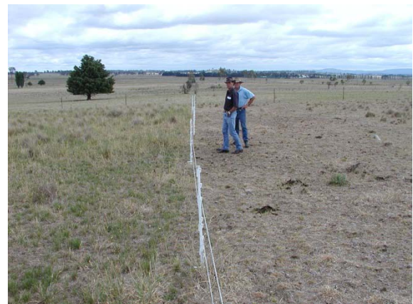
Inspecting a farmlet C paddock with temporary fencing during drought in November 2002