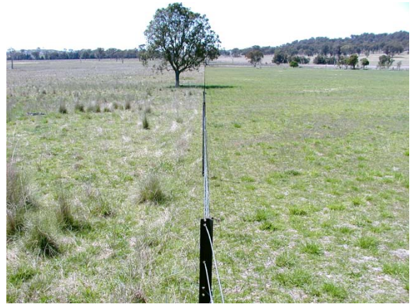
Fenceline image of farmlet C (LHS) and farmlet A (RHS) in October 2006