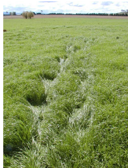
Ungrazed Italian ryegrass on farmlet A in May 2002