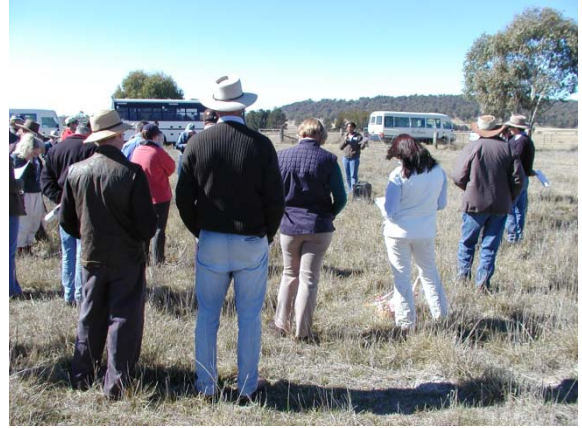
Field trip during the Cicerone symposium in May 2006