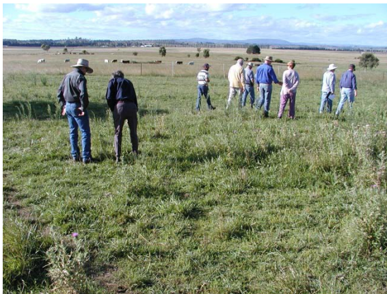
The Cicerone Board inspecting a pasture on farmlet A in March 2004