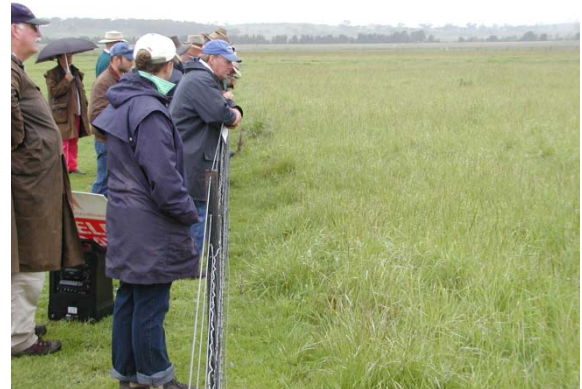
Inspecting a recently renovated pasture on farmlet C in October 2005