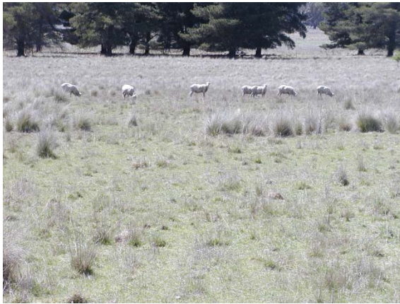
Patch grazing on farmlet B in October 2006