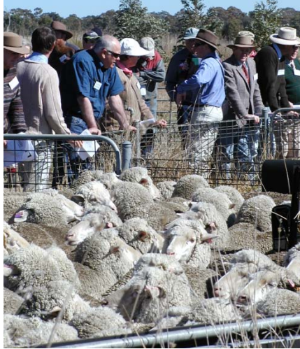
Inspecting sheep during Cicerone symposium in May 2006