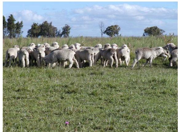
Sheep on farmlet A in March 2004