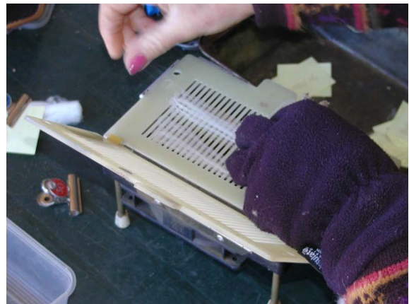
Measuring a wool staple in July 2004