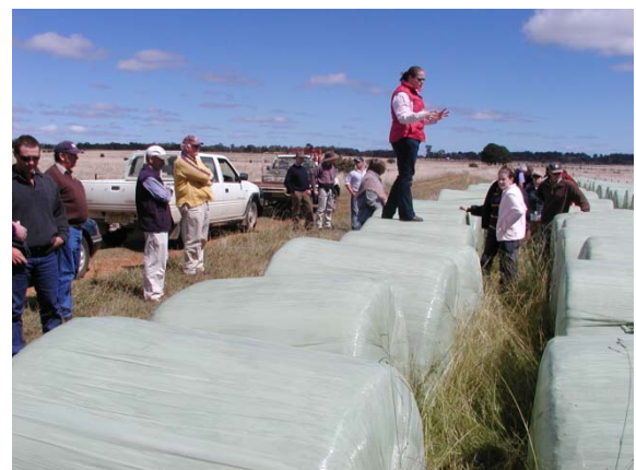
Field day on silage making on farmlet A in March 2006