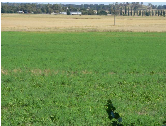
Lucerne regrowth in January 2006 after recent silage harvest on farmlet A