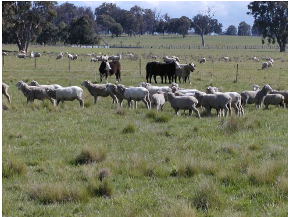
Sheep and cattle on farmlet C in October 2003