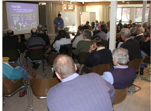
Cicerone seminar held in November 2003