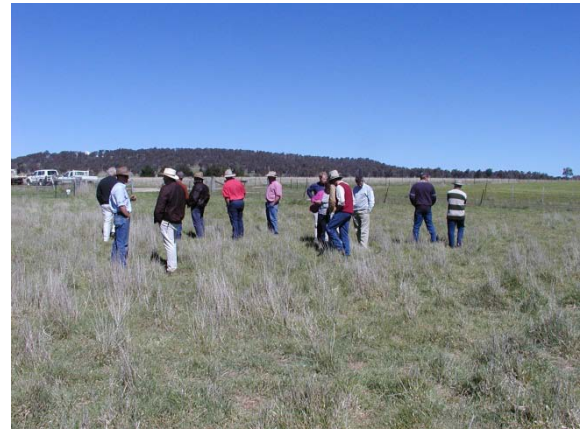
Assessing a pasture on farmlet A in October 2001