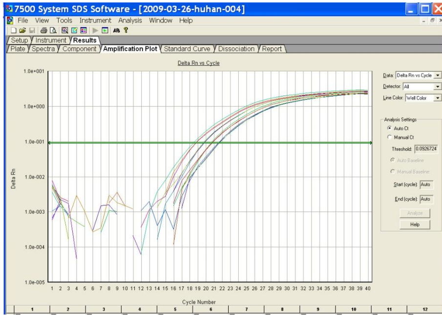
Fig. S3. PCR efficiency of primers.