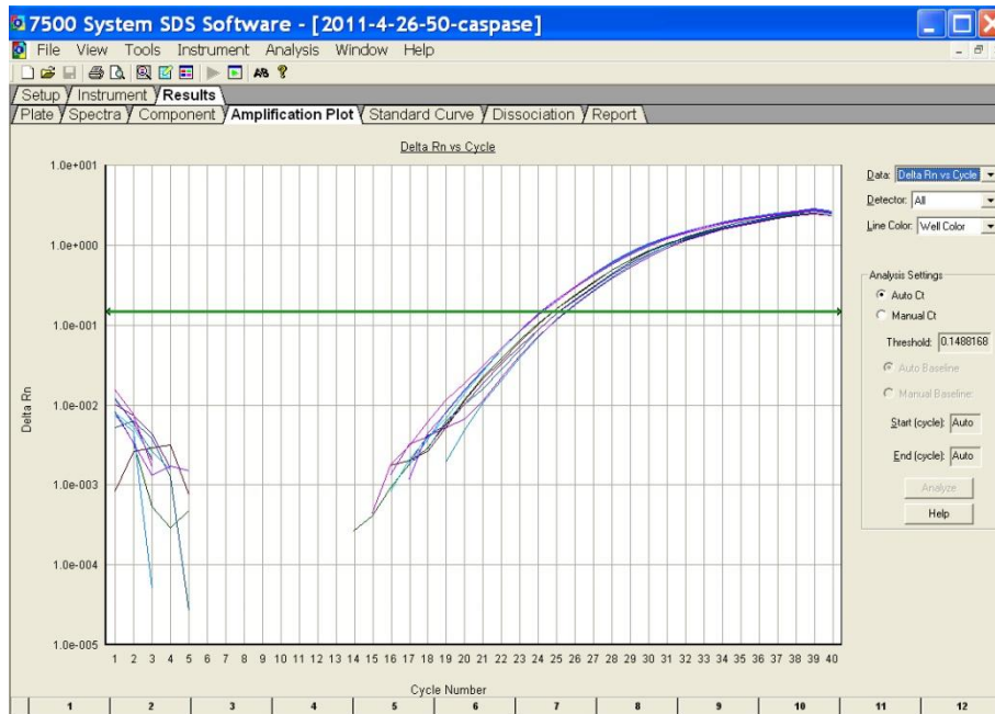
Fig. S1. Amplification curve of one of the Caspase genes.

Supplementary material for quality check of real-time PCR.