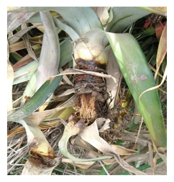
Fig. 3. Symptoms of soft rot of pineapple caused by Phytophthora cinnamomi, courtesy of A. Drenth.

During question time in the Queensland Legislative Assembly in April 1892 it was revealed that two plants (one healthy, one diseased) had been sent to the New South Wales vegetable pathologist Nathan Augustus Cobb (1859–1932), who replied that because the disease was new he would need to inspect the site (of collection) to provide a definitive diagnosis. A request by the Queensland government to the New South Wales government to allow the visit