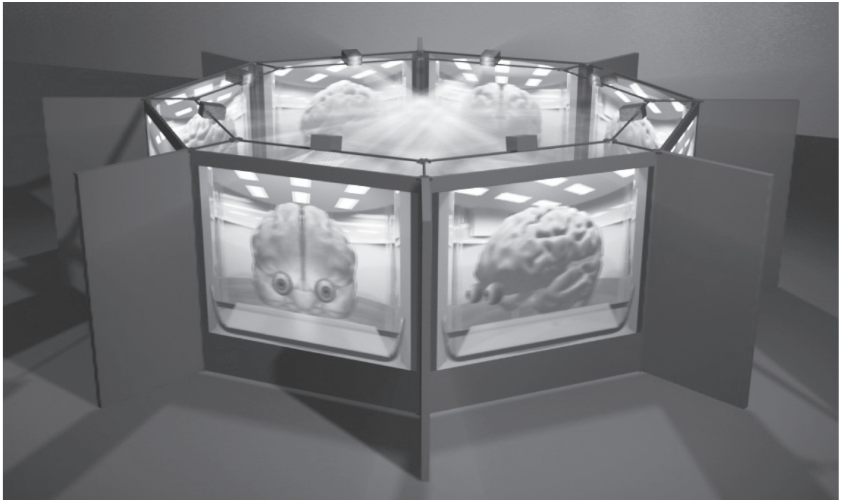
Figure 2 The Virtual Room, an eight-wall, rear-projected stereoscopic system that the audience can walk around in order to see a ‘contained’ version of a dataset. Image by E. Hallein.