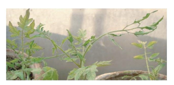
Fig. 1. Shoestring symptoms on tomato 25 days post inoculation.

For further identification of the virus isolate at molecular level, total RNA was isolated from naturally infected tomato leaf tissue as described earlier (Spears and Longhurst 1993) and reverse transcription-polymerase chain reaction (RT-PCR) was performed. A pair of primers specifically designed from the sequence data of CMV-Fny (GenBank accession D10538) for the amplification of the complete RNA 3 genome of CMV was used. The sequences of the reverse and forward primers were: