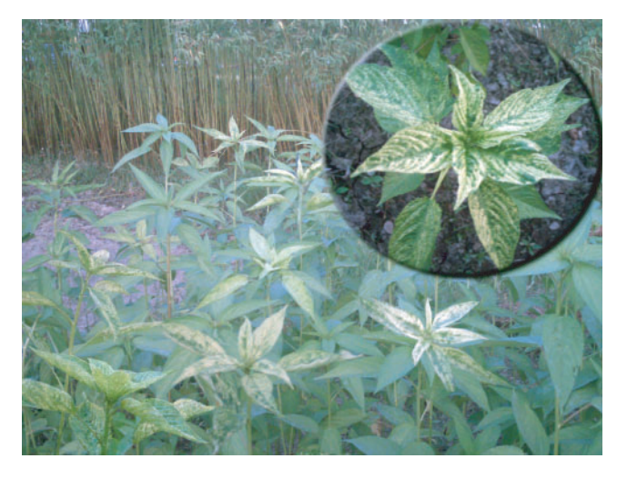
Fig. 1. Yellow mosaic disease of Corchorus capsularis plants grown under field conditions. (Inset) a close view of the symptoms on leaves.

symptom and allowed to feed for 24 h. After virus acquisition, each set of viruliferous whiteflies was released onto 30 healthy jute seedlings (five seedlings per pot) and was contained by a small plastic cylindrical cage (7.5 \times 2.5 \text{ cm}) . After a 12-h transmission period, the plants were sprayed with 0.2% dimethoate (Rogor) and kept in an insect proof rectangular cage until symptom development. The experiment was repeated three times with 30 plants in each case. The same numbers of healthy plants were also inoculated with nonviruliferous whitefly as controls in each replication and no symptom expression was observed in these plants. Typical yellow mosaic symptoms of the disease were observed on glasshouse-grown healthy plants of cv. JRC 7447 and JRC 212 after 10 days of viruliferous whitefly transmission. It has been observed that when 10 whiteflies were used for transmission the efficiency was 60%, but the transmission efficiency was as low as 20% when only three viruliferous whiteflies were used.