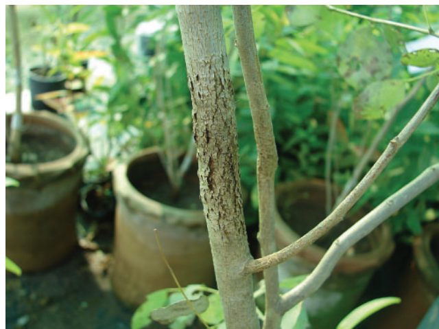
Fig. 4. Young shisham plants showing bark-cracking symptoms from Ceratocystis fimbriata infection.