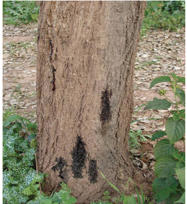
Fig. 1. Mature shisham tree showing initial infection symptoms of stem gummosis from Ceratocystis fimbriata infection.

Ceratocystis fimbriata (Ceratocystiaceae: Microascales) has been reported from a number of hosts around the world showing similar decline symptoms. These include mango ( Mangifera indica ), coffee ( Coffea arabica ), apricot ( Prunus armeniaca ), almond ( Prunus amygdalus ), Eucalyptus spp (Baker et al. 2003), citrus ( Citrus sp.) (Borja et al. 1995) and rubber ( Hevea brasiliensis ) (Silveira et al. 1994). No previous record was found in the literature of an association of this fungus with shisham decline, but a possible association of this fungus with the disease was conjectured because of symptom similarities between shisham decline and mango decline caused by C. fimbriata .