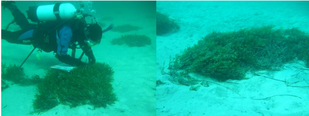
f) Double bag 4 years

Accessory Publication: Images of restoration techniques after between 1 month and 4 years in situ.