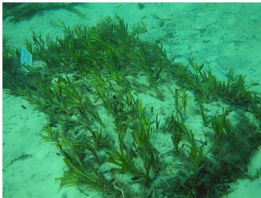
a) Double bag 1 month