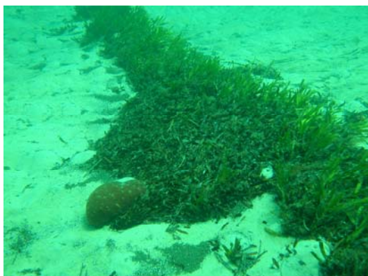
c) Hessian strip 1 month