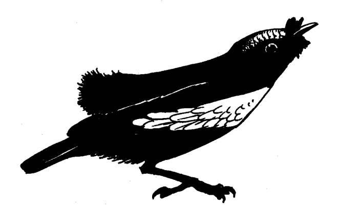
FIGURE 1 Wild adult Superb Bird of Paradise in Initial Display Activity sleeked posture.

This was observed seven times and consists of a sleeked pose, held for about five seconds, before movement of cape, breast and naral tuft plumage. The male slightly crouches with breast shield sleeked tightly back against himself, cape held back and down against the back, wings and tail held normally, head and bill pointed upwards with eyes fixed on the female, and naral tufts projecting conspicuously forward and bifurcate (Fig. 1). This pose is followed by a repeated, sudden, upward and outward extension of the breast shield, with head and bill still pointing at the female and naral tufts unaltered. Interspersed with this breast shield flashing is a cape-flicking action in which the cape is flicked well forwards above and over the head but not spread as in HID (see below), with an exaggerated downward movement of the head that shows the iridescent crown to the female (Fig. 2). Breast shield flashing and cape-flicking increase in tempo as the IDA progresses. It appeared that breast-shield flashing and cape-flicking always alternated during this rapid performance. During IDA wings and tail appear to be held in normal position.