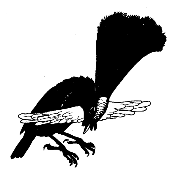
FIGURE 2 Wild adult male Superb Bird of Paradise in capeflicking and crown presentation posture of Initial Display Activity directed at the female.

If the female moved during IDA the male took a few short steps to turn and face her at all times but after so doing reverted to a brief sleeked, slightly crouched, posture (as above) before recommencing IDA.