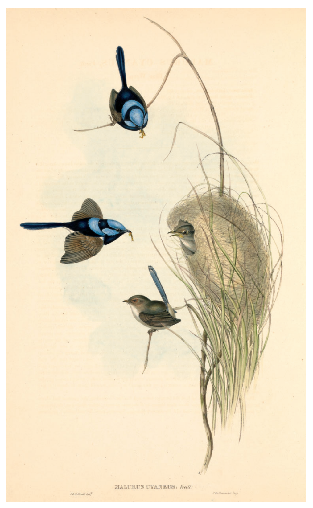
Fig. 1. Malurus cyaneus Vieill. lithograph from Gould (1840–1848) showing adult Superb Fairy-wrens attending their nest with the brood parasite Bronze Cuckoo nestling.