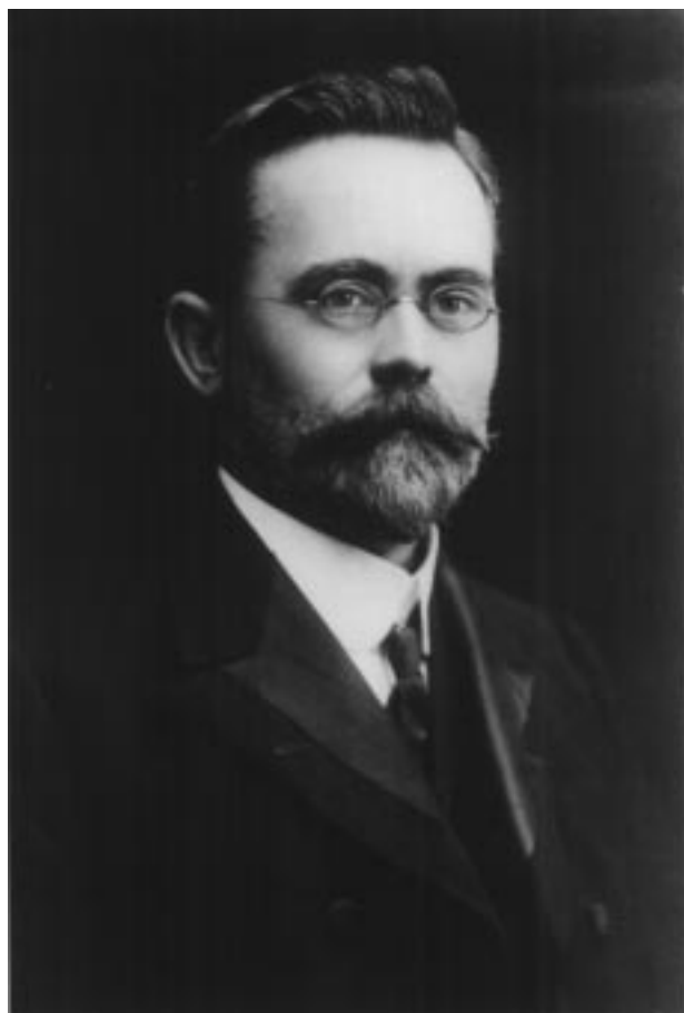
Figure 5 —Charles John Merfield.

Mercury and Venus, minor planets, Jovian satellite phenomena, lunar occultations, solar and lunar eclipses, variable stars and double stars) and associated publications (e.g. see Orchiston 1982; Tebbutt 1908). In addition, in 1881 Tebbutt discovered a second Great Comet, C/1881 K1 (Orchiston 1981). He also actively popularised astronomy (Orchiston 1997a), offered a local time service, maintained a fully-equipped meteorological station, and kept records of local floods and freshes. He was the founding President of the New South Wales Branch of the British Astronomical Association (Orchiston 1988a), and was awarded the Jackson–Gwilt Medal and Gift by the Royal Astronomical Society in 1905 for his long and valuable service to astronomy. In more recent times, his face has featured on an Australian $100 note, and a crater on the Moon has been named after him. John Tebbutt died at Windsor in 1916.