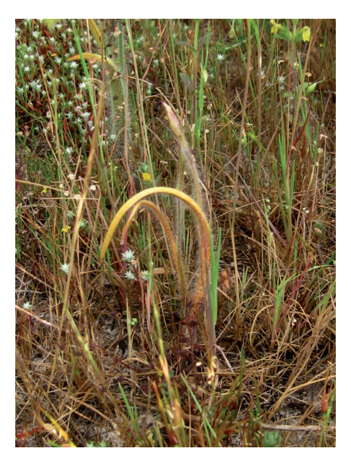
Fig. 4. A sign of the times: a prematurely withered plant and aborted inflorescences of the swamp spider orchid, Caladenia paludosa , in an urban reserve near Perth is symptomatic of the threat of climate change on the survival of many Caladenia species in temperate Australia. The impact of below-average rainfall thought to be linked to climate change is likely to have serious consequences for sustaining Caladenia , particularly rare and threatened taxa.

Ultimately, the dire predictions of impacts of climate change (Fig. 4) for species existence will require consideration of 'assisted migration' where species, including common taxa, will need to be translocated to new, climatically buffered safe-sites as home ranges contract (McLachlan et al. 2007).