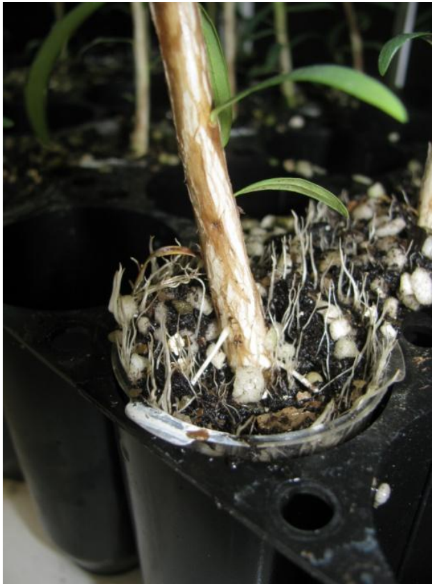
Figure 1 of Supplementary material. Adventitious roots on a 112 day old M. alternifolia seedling 7 days after initiation of a waterlogged treatment. Both Terrestrial Aquatic Roots (TAR) and Aerial Aquatic Roots (AAR) are evident. Terrestrial Aquatic Roots are finer roots that originate off primary roots and grow upwards in response to soil waterlogging, whereas AAR are more succulent, thicker roots that develop on the stem, mostly promoted by stem submergence. Scale; Pot diameter = 35 mm.