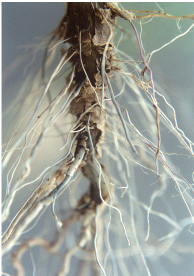
Fig. 3. Detail of damage caused by Fusarium oxysporum on roots of Asclepias curassavica .

of 6.2 mL, enclosed in a polyethylene bag and incubated at 22–24°C with a 12-h photoperiod for 5 days. The bags were then removed.