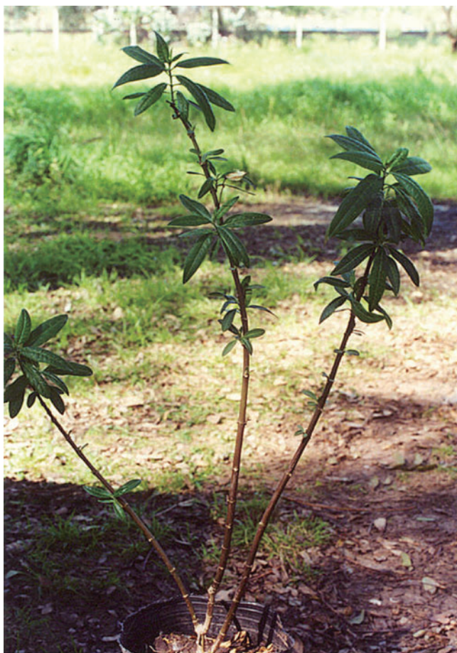
Fig. 1. Defoliation of a potted plant of Asclepias curassavica caused by Fusarium oxysporum .

Pathogenicity tests were conducted by watering potted plants with a suspension adjusted to 1.2 \times 10^6 conidia/mL of sterilised distilled water. Control plants were irrigated with sterilised distilled water. Each plant was irrigated with a mean volume