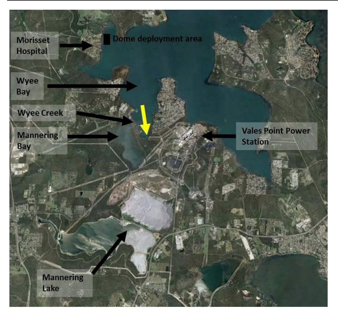
Fig. S1. Google Earth image of the area near the Vales Point Power Station and the surrounding bays. The yellow arrow indicates the cooling water discharge point.