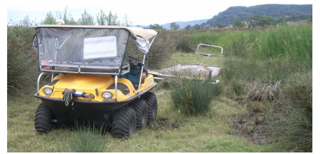
Figure 2 A Slingram TEM system designed for rougher terrain, easy setup and packup, and with ability to be driven through narrow gaps.

Figure 1 The AgTEM2 (Groundwater Imaging 2010) survey platform during early trials. The platform is designed to quickly transform from road legal form to survey capable form. It is designed to resolve a large depth of investigation from 1m to 100m (and in the future potentially 100's of metres). Booms fold in and out via remote control. The Trailer, made of fibreglass, has a drawbar which extends to separate the closest transmitter loop edge from the towing vehicle by 5m raising its ground clearance to over 1m as it does so.