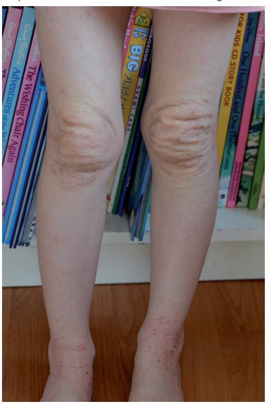
Figure 3. Dermal atrophy to anterior knees evident as 'elephant wrinkles' three months after ceasing TCS