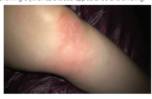
Figure 1. Autonomic features in complex regional pain syndrome (CPRS). The patient's knee and proximal shin showing erythema, bruised appearance and swelling.

leg and brain, which were now contributing to her pain and disability.