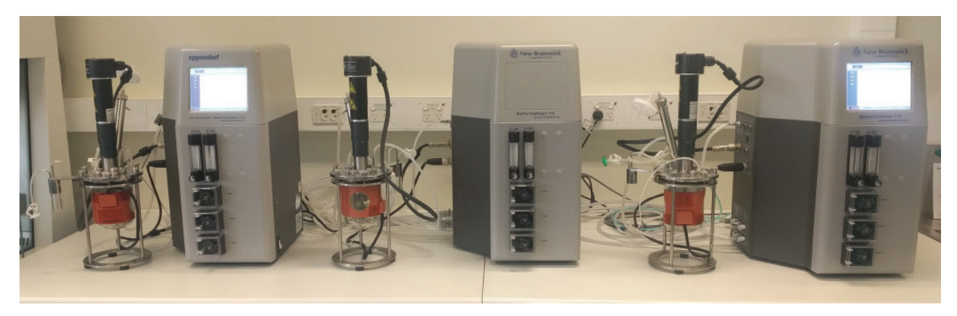
Figure 3. Stirred tank bioleaching reactors set-up for optimisation of REE recovery from phosphate bearing ores.

established and as the system stabilises with increased numbers of indigenous species, the need to add further glucose is reduced. As it has been demonstrated that the native consortia alone are capable of REE leaching albeit at very low levels, initiation of indigenous activity appears to require one or more unknown metabolites that arise as a result of the inoculant species fermenting glucose.