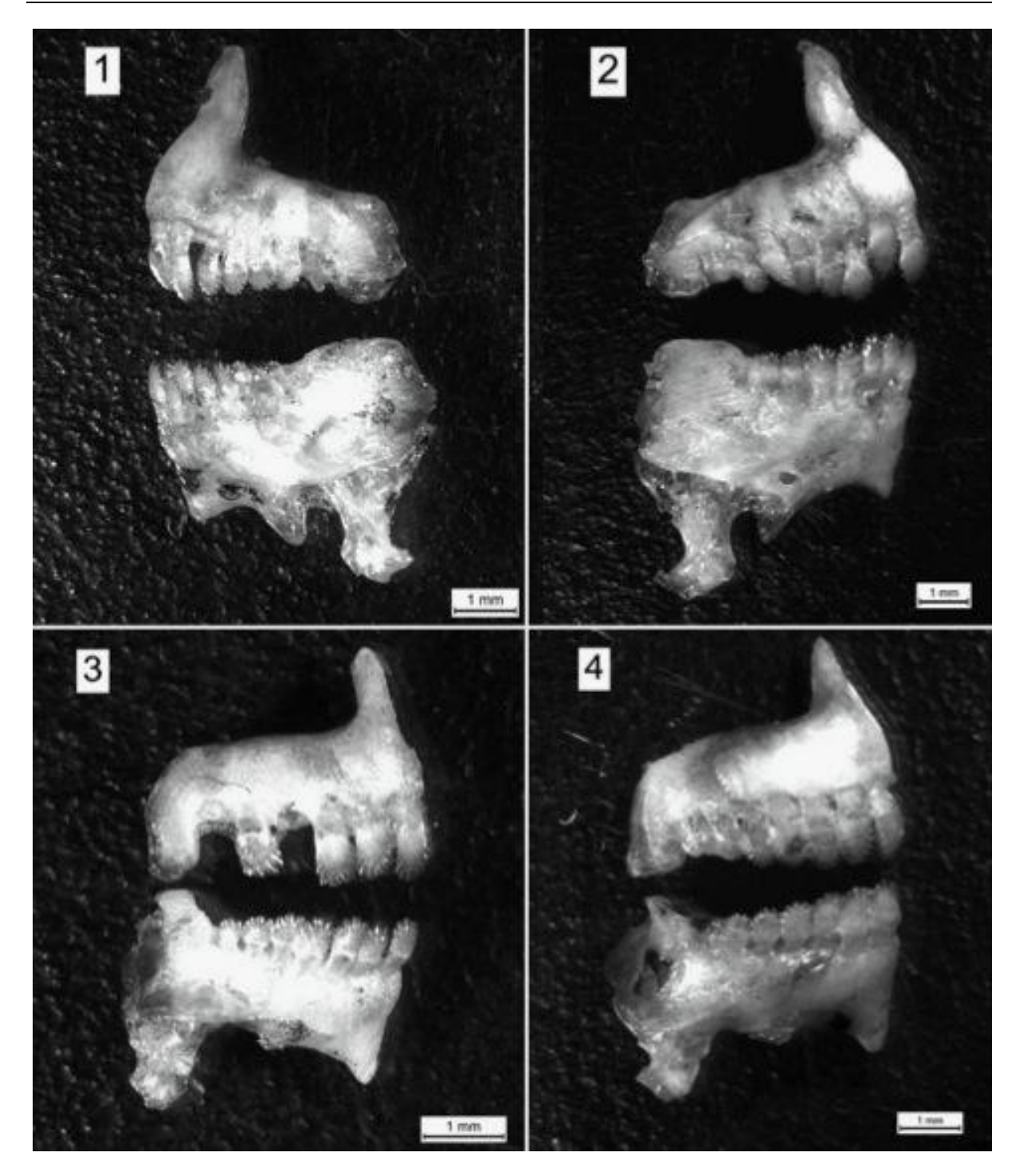
Fig. S1. Stereoscopic microscope images of the morphology of the jaw apparatus of (1) Prionurus maculatus , (2) Prionurus microlepidotus , (3) Acanthurus triostegus and (4) Acanthurus dussumieri . Scale bar: 1 mm.