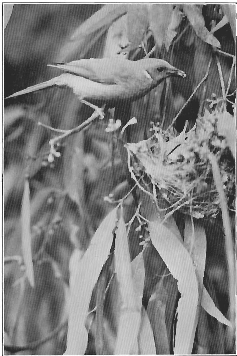
Male White-plumed Honeyeater feeding young with scale insects and nectar. From this position it reached over the nestlings to take excreta.