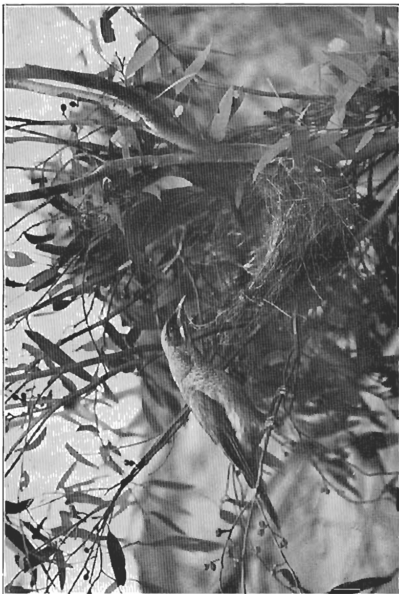
Yellow-throated Miner at nest.