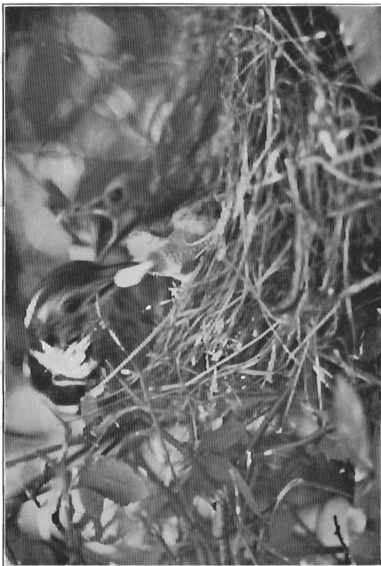
Song-Thrush removing excreta direct from cloaca of nestling.