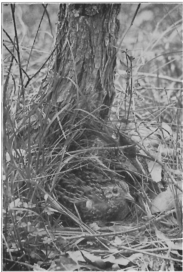
Painted Quail brooding.