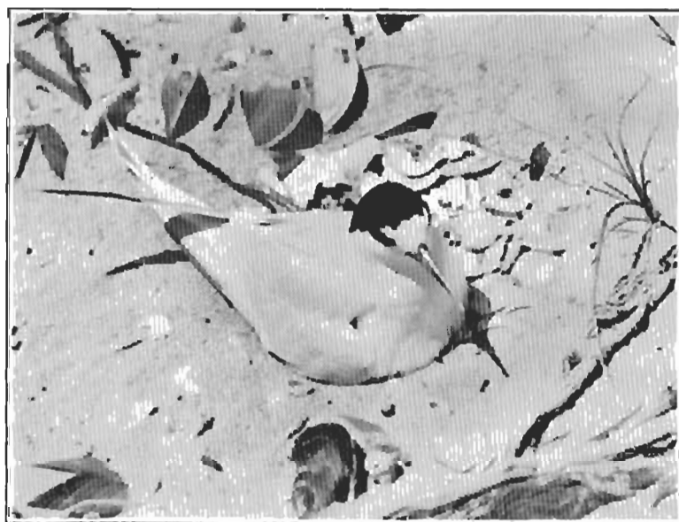
Fairy Tern brooding.