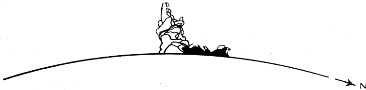
Fig. 3.—Composite sketch of the leading edge of the second surge at 60 second intervals, between 1452 and 1506 U.T. Darkened outline shows the initial stable prominence.

Six minutes after the first suggestion of this slow-starting second surge, some very fast material seemed to break through it and speed upward with a velocity (between 1500 : 30 and 1502 : 19 U.T.) of nearly 520 km/sec. Thereafter,