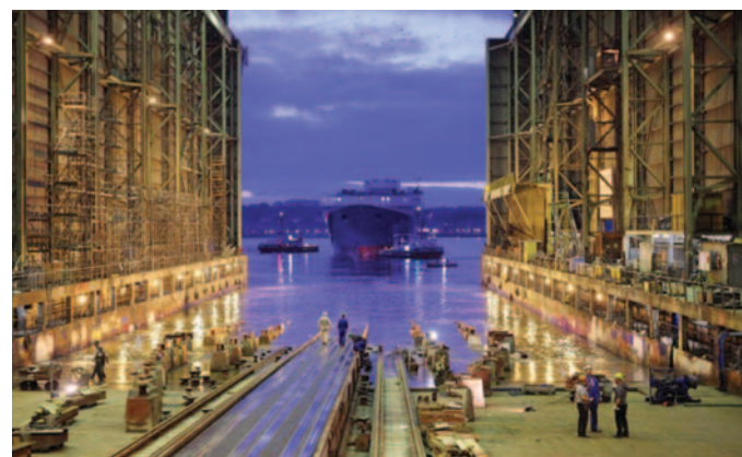
WesternGeco's Amazon Conqueror being launched in Germany

Schlumberger and WesternGeco offer its clients four key advantages: