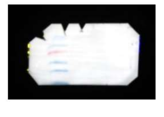
Fig. S1. Exemplary blots for negative controls of primary rabbit IgG. Negative controls for rabbit IgG were performed exactly as positive blots (random protein samples used in the study), except for the use of non-immunised rabbit serum diluted in TBST instead of primary antibodies.