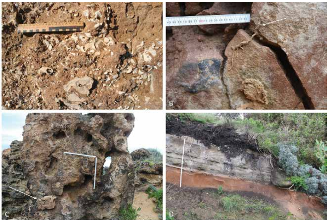
Figure 2: A. Shell aggregation on top of West Stack, originally identified as a possible midden by Edmund Gill. B. Rhizomorph bridging a fracture on abrasion surface, Block B, together with blackening of surface on left side (scales for A and B in centimetres). C. Rotated block (Block F) showing pothole-like depressions on surface. Some depressions contain stones; block of calcrete on surface (arrow; horizontal and vertical scales = 50 cm). D. Terra rossa (palaeosol) of unit Q2 beneath weathered, stratified Tower Hill Tuff (unit P), Hopkins River section (scale = 100 cm).