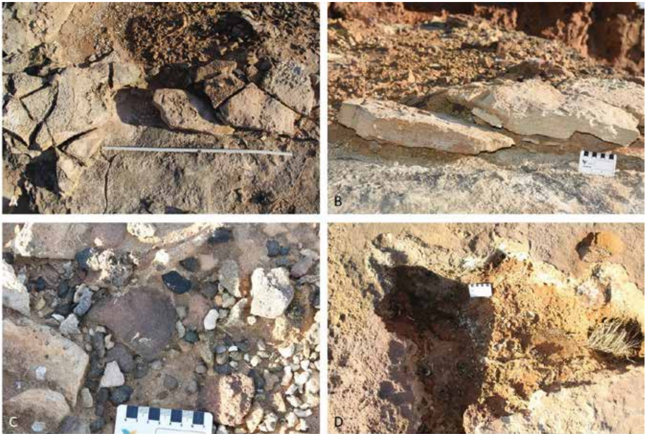
Figure 8: A. Fractured calcrete Rcp, West Stack North (scale = 100 cm). B. Imbricated calcrete blocks, West Stack North. C. Limestone clasts, including blackened stones, West Stack North. D. Erosional pit in Gs \alpha partially filled with shelly sandstone, West Stack South. Scale in B , C , D in centimetres.