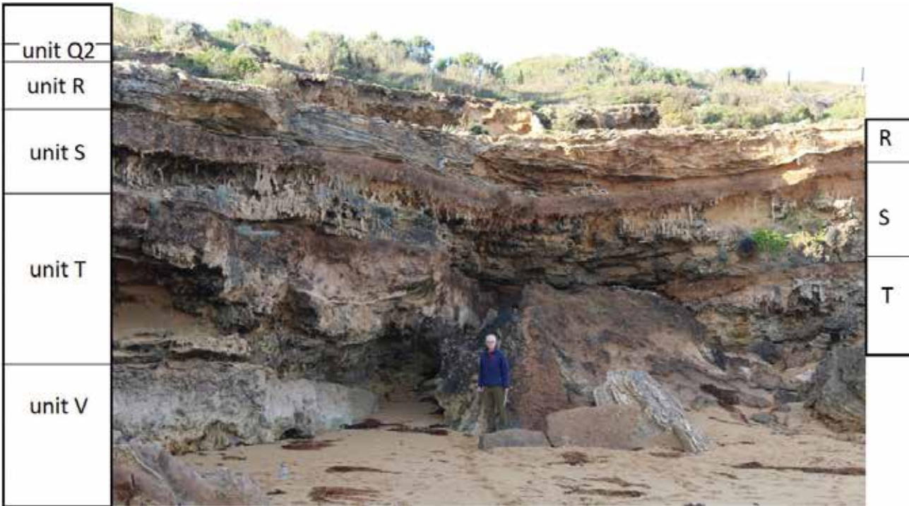
Figure 6: Stratigraphic section, Bridgewater Formation (Pleistocene), Moyjil, Warrnambool. Formation is divided into informal units, mostly of calcarenite–palaeosol. The surface at the top of unit R is Gs \alpha , and is exposed as a platform at the top of the main cliff.

Unit R. Unit R is a calcarenite–calcrete body exposed on the headland, the top of West Stack and the adjacent collapsed block to the east, and on the flanks of the Dennington dune up to 400 m west of Moyjil (Kay 2014; Figure 6); it also occurs as displaced calcrete blocks on the top of East Stack. It has three components— a basal calcrete