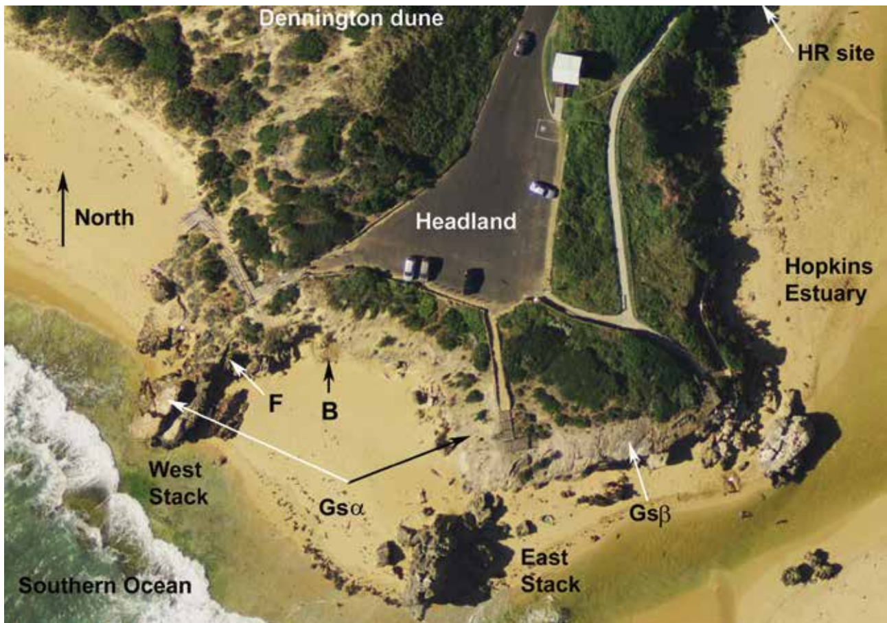
Figure 3: Geomorphic features of Moyjil, Warrnambool, including: headland, estuary of Hopkins River, East Stack, West Stack and Dennington dune. The locations of two fallen blocks (B and F) referred to in the text are also shown.

The problem of the shell assemblage's age was first addressed by Prescott and Sherwood (1988), Goede (1989) and Sherwood et al. (1994), and reviewed by Nair and Sherwood (2007). The unexpectedly old ages obtained ( >60 ka) have prompted a new phase of geochronological study (Sherwood et al. 2018a). The earlier investigations employed conventional radiocarbon, thermoluminescence (TL), uranium/thorium radiometric dating (U/Th) and amino acid racemisation techniques (Sherwood et al. 1994) and electron spin resonance (Goede 1989). Radiocarbon analysis of charcoal and shell from the site indicated antiquity beyond the method's limit ( >\sim 40 ka). TL dating of quartz from the sandy matrix to the shells yielded an age of 67 \pm 10 ka. Further, TL dating of discoloured (heated?) stones suggested that either the colouration had another cause or that the stones had not been heated sufficiently to reset their quartz grains, as the stone TL ages significantly exceeded the sand TL age (Prescott & Sherwood 1988; Sherwood et al. 1994). Oyston (1996) subsequently used TL to re-examine the age of the sands and found them to be late Last Interglacial (LIG) — 80 \pm 10 ka and 93 \pm 11 ka. Note that we use the term LIG to refer to the whole of MIS stage 5 (i.e. 80–130 ka), the last time sea levels