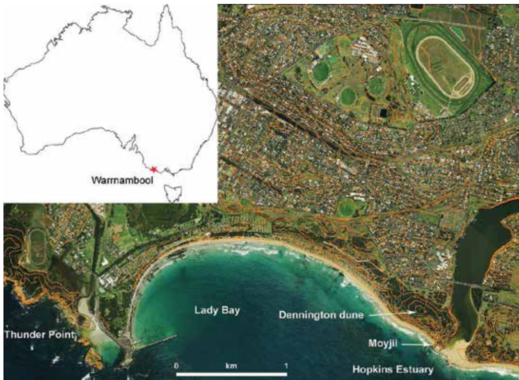
Figure 1: Locality map, Moyjil, Warrnambool, Australia. Contours at 5 m interval highlight dune morphology at Moyjil and Thunder Point.