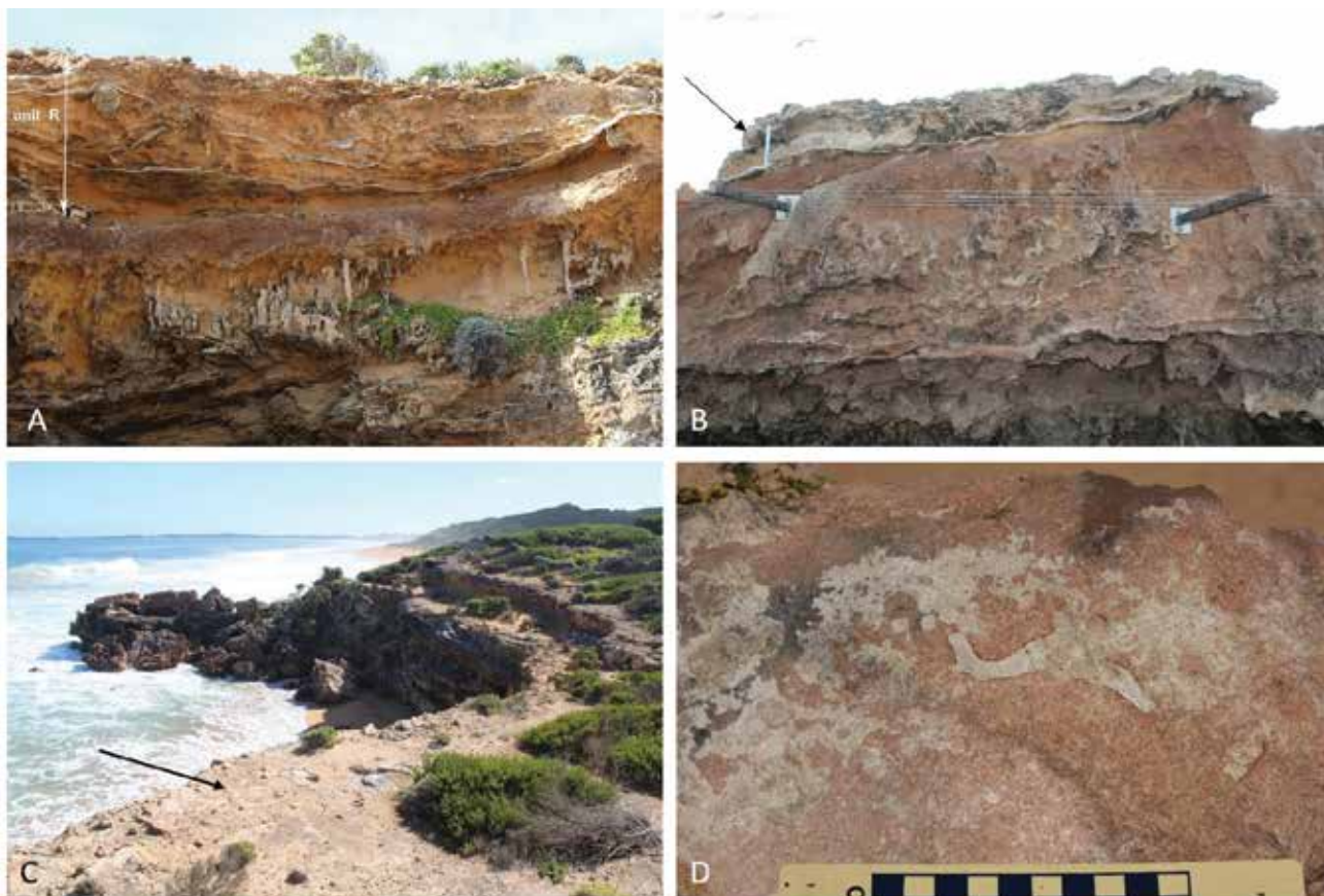
Figure 7: A. Unit R, headland: calcrete Rcp planar at top of cliff and sheetlike below to top of unit S (reddish palaeosol). Maximum thickness of unit R ~1.4 m. B. Calcrete Rcp and residual sand, unit R (arrow), capping West Stack; overlie unit T (reddish palaeosol). Scale = 25 cm. C. Gs \alpha , exposed as horizontal platform (arrow) on headland at top of cliffs; overlies calcrete Rcp, underlies unit Q2. D. Gs \alpha (detail), showing section through possible burrow exposed at abrasion surface, with partial coating of calcrete Q2cp (scale in centimetres).

developed on Rcp (West Stack and headland), it steps upward to cut across Rcs (exposures 150–300 m north-west of Moyjil; Kay 2014). Abrasion on Gs \alpha in the western part of the headland (adjacent to the point of restoration of Block B; see below) has truncated a possible burrow in the palaeosol of unit S (Figure 7D). On West Stack, the calcrete below Gs \alpha is pervasively fractured to produce polygonal blocks, some of which have been displaced (Figures 8A, B). Cemented to Gs \alpha on West Stack is the basal part of unit Q2, which contains features of archaeological interest, including marine shells (Figure 2A; Nair & Sherwood 2007) and an assemblage of calcrete fragments, many with dark-grey surface staining and some showing evidence of displacement (Figure 8C).