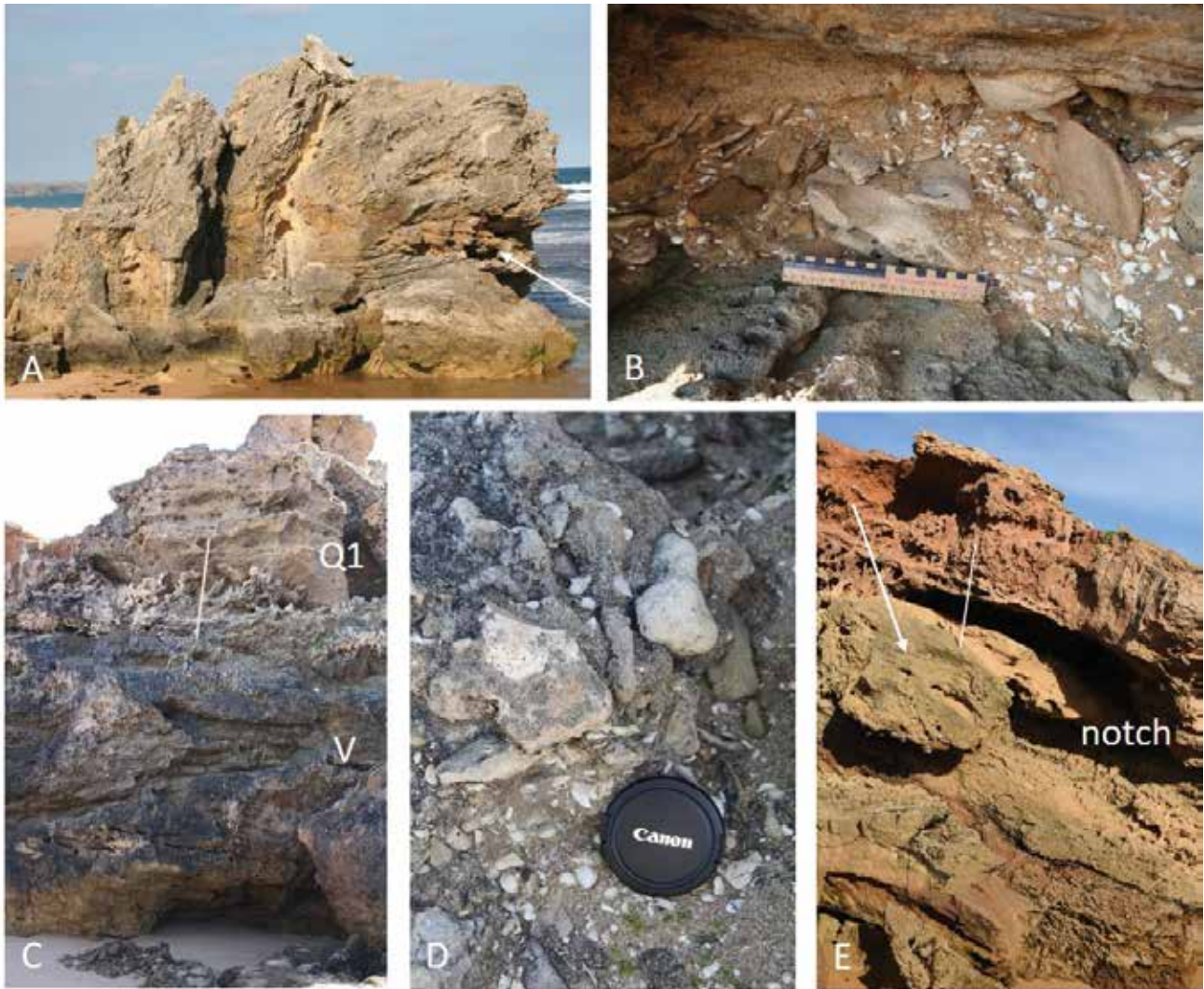
Figure 5: Wave-cut notches and beach deposits (unit Q1) formed during the LIG at Moyjil, Warrnambool. A. Notch occupied by unit Q1 (arrow), East Stack, view east; stack largely consists of unit V. B. Detail of gravel–sand–shell deposit (unit Q1), East Stack (scale = 20 cm). C. Units Q1 and V, West Stack North (view west). D. Detail of gravel–sand–shell deposit (unit Q1), West Stack North (lens cap = 5.8 cm). E. Notch partially filled with sand (unit Q1, arrow), West Stack South, view east (stack is tilted). Scales in C, E = 100 cm.

upstream from the mouth, 3–4 m above river level and 5–6 m in lateral exposure. It is significant as an example of the soil mantle which is likely to have covered the uppermost of the calcrete surfaces now exposed at Moyjil.