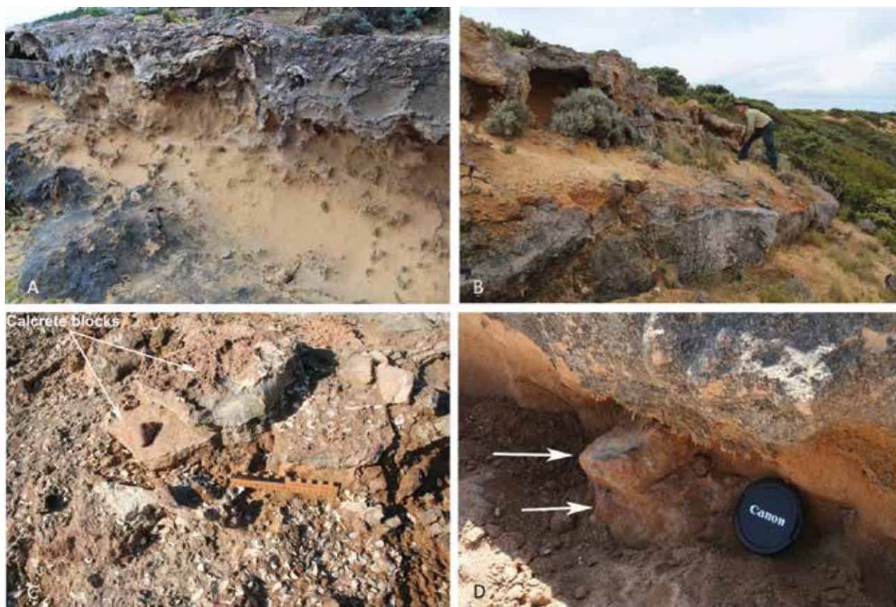
Figure 10: A. Unit Q2 on Moyjil headland showing friable sand capped by calcrete. B. Two calcrete horizons in Dennington dune, ~300 m north-west of Moyjil. Lower calcrete is Rcs at top of unit R; upper calcrete is Q2cs, part of unit Q2 which includes unconsolidated sand between the two calcretes. C. Calcrete and palaeosol blocks, shells and sandy matrix on top of West Stack North. Scale is in centimetres. D. Discoloured calcrete blocks (arrows), one on top of the other, and cemented together, at base of unit Q2; Moyjil headland. Lens cap = 7.2 cm.