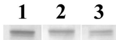
Fig. 1. Amount of PsaA/B protein per unit leaf area determined by Western blotting. 1: untreated, 2: chilled, 3: three days after the chilling treatment. The band intensity decreased to 85% and 52% in lane 2 and 3, respectively.

When cucumber leaves were treated at 4°C for 5 h under the light at 190 \mu\text{mol m}^{-2} \text{s}^{-1} , less than 20% of the PsaA/B proteins were degraded just after the treatment (Fig. 1, lane 2). However, the PsaA/B proteins were gradually decreased in subsequent three days, and about 50% of the proteins were degraded on the third day after the treatment (Fig. 1, lane 3). From this result, we can conclude two points. First, the degradation of PsaA/B is not caused by the photo-cleavage during the inhibitory condition. Some enzymatic process must be involved in the degradation of PsaA/B. Secondly, the inhibited PSI complex are somehow 'tagged' during the photoinhibitory treatment, and the tagged complex is targeted by the proteolytic enzyme. Upon photoinhibition of PSI, iron-sulfur centers, F_A , F_B and F_X were destroyed (Sonoike et al. 1995a). Conformational change caused by the destruction of iron-sulfur centers may be the substance of the 'tag'. Some serine-type protease was suggested to be responsible for the degradation of PsaB protein (Sonoike et al. 1997). We propose that a serine-type protease degrades PsaA/B proteins whose conformation is changed by the destruction of iron-sulfur centers upon photoinhibition.