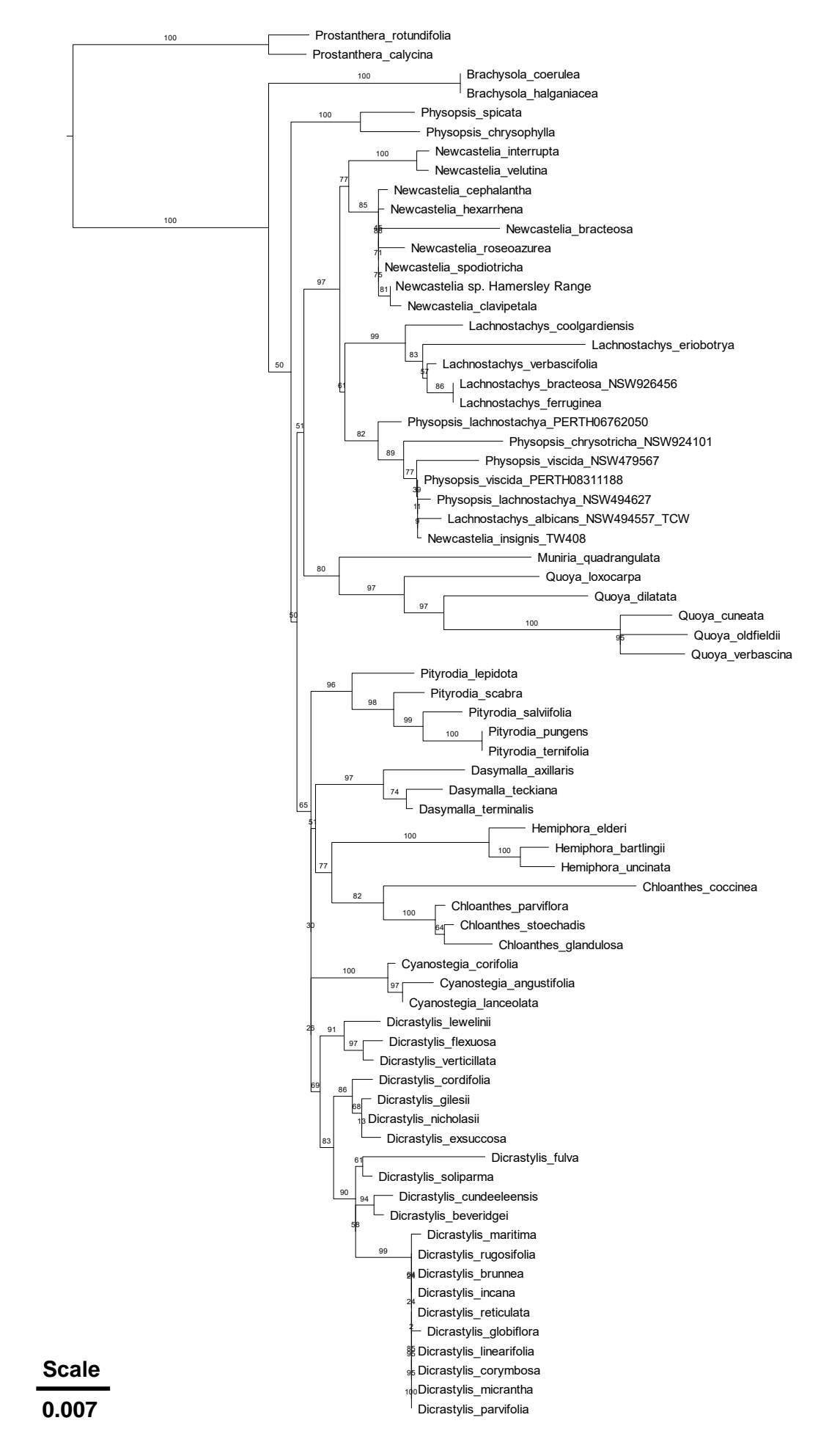
Fig. S1. Phylogram for Chloantheae based on RAxML Maximum likelihood analysis of the aligned nucleotide sequence of the chloroplast regions ndh F and psb D– trn T. Bootstrap values are indicated above branches.