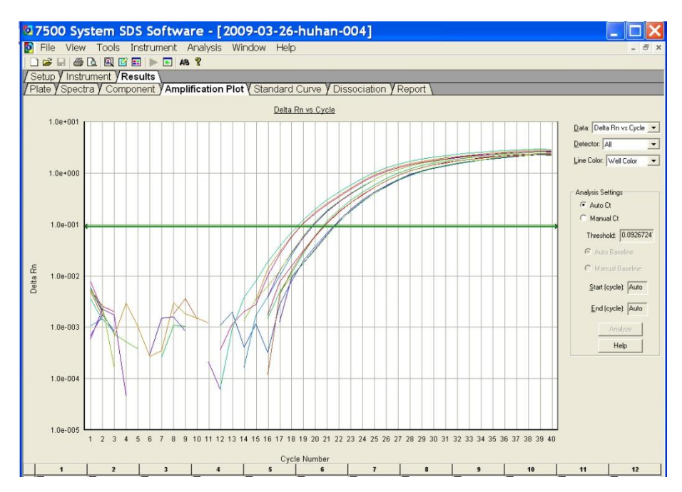
Fig. S3. PCR efficiency of primers.