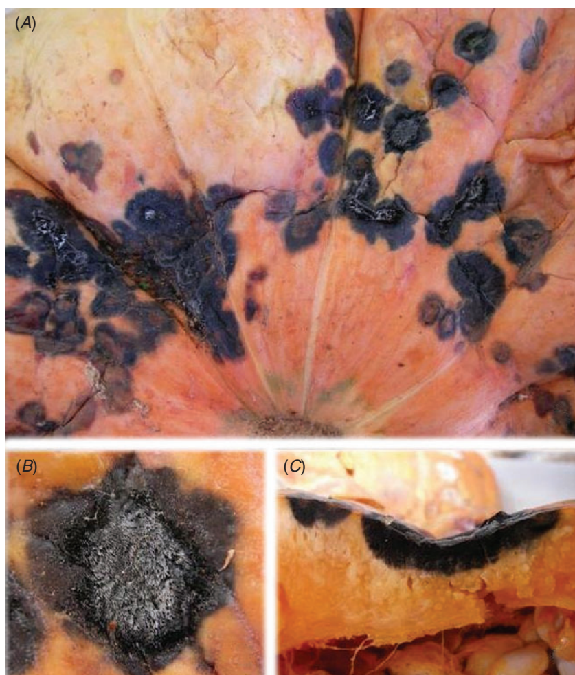
Fig. 1. (A) Necrotic spot symptoms on external surfaces of a C. maxima fruit. (B) Detail of a spot showing a velutinous aspect due to the abundant production of acicular conidia. (C) Section showing the internal necrotic rot symptoms (VIC 30471).

The fungus had the following morphology (VIC 30471): conidiophores arising from erumpent intraepidermal stromata,