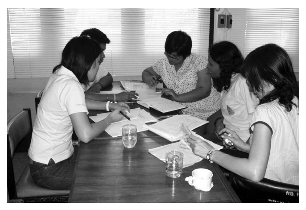
Dairy advisers from Thailand collating information from a farm visit.