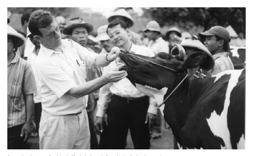
Assessing the age of a dairy heifer in Indonesia from its teeth development.

One key feature of the dairy industry in Australia is regular farmer meetings, where groups of farmers visit other farms, particularly those that have proven to be successful in adopting improved farm practices. To be successful, such 'farmer discussion groups' need a clear focus and set of objectives, such as: