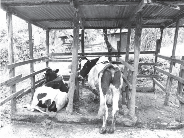
Figure 2.2: Even on smallholder farms, there is a wide range in milk production per cow. These pictures were taken in Kenya on two free stall adjoining farms, highlighting the results of their variation of feeding management and cow comfort. (a) These Friesian cows were averaging 14.4 L milk/cow/day with each cow provided with a thick sponge rubber mat on which to lie. (b) These Friesian cows were only averaging 5 L milk/cow/day with no soft bedding. Note the difference in cow size and body condition between the two farms.