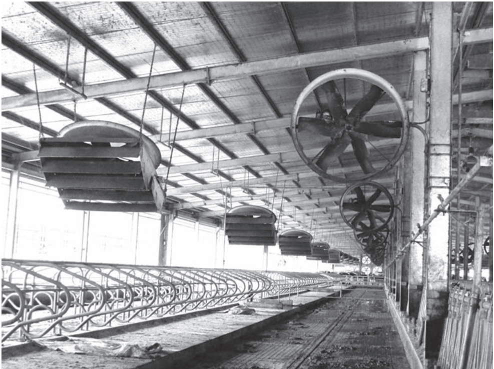
Figure 2.1: No matter what the milk production system in the tropics, there is a need for additional ventilation to reduce the adverse effects of heat stress during summer. This picture is of a large free stall shed in North Vietnam with fans directing air into the free stalls as well along the feeding face of the shed.