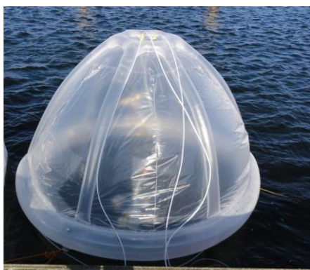
Fig. S2. Picture of surface mesocosm.