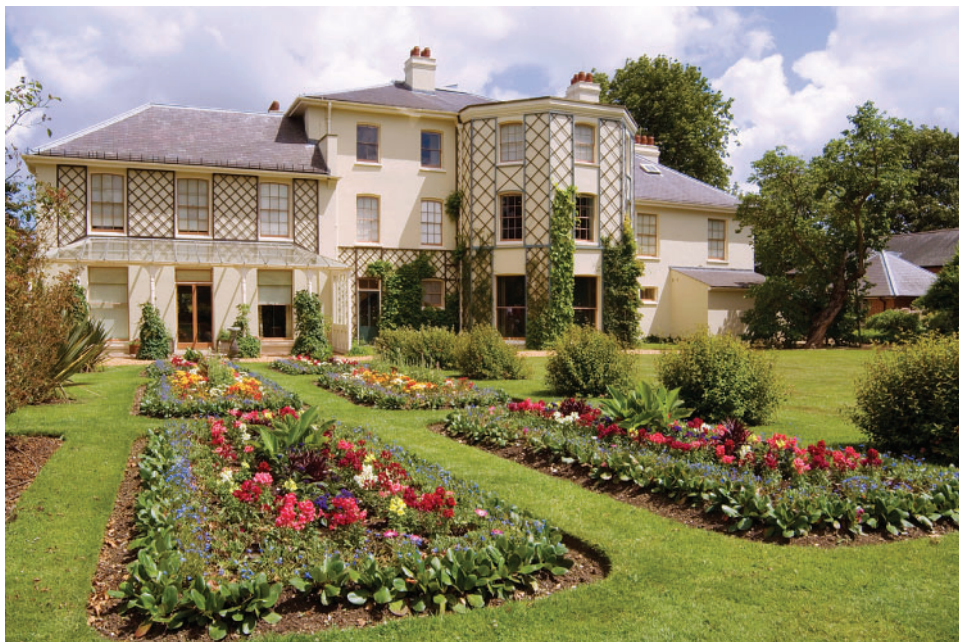
Fig. 2. Down House, Darwin's home where he carried out his botanical experiments.

The major contribution of plants to his theory came, however, from his observations and experiments with plants at his home Down House, in Kent (Fig. 2), where he took up residence in