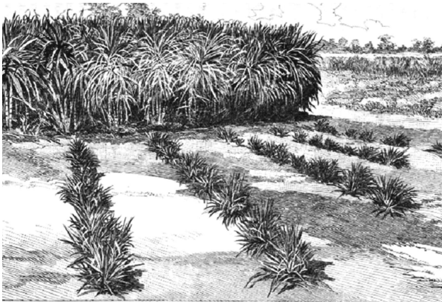
Fig. 2. Drawing of sugarcane stools planted from healthy (background) and diseased setts (foreground), After Cobb (1905), fig. 11, https://babel.hathitrust.org/cgi/pt?id=hvd.hxj1jc&view=1up&seq=151&q1=GUMMING 109 .

of the top parts of the stalks, shooting of the buds at the top of the stalk, internally red patches of tissue spreading from the buds up and down the stalk and rotting of the roots. 7 He had sent samples to 'the plant pathologist' (presumably Nathan Cobb, the New South Wales vegetable pathologist) who found that there was no 'widespread' fungus. Despeissis concluded that the disease was caused by insects including the clavicorn beetle (probably the fungus-eating Brachypeplus binotatus ) that burrowed into the stalk and induced local fermentation of the tissue, the resulting poison spreading throughout the stalk. O'Kelly wrote a report of his findings in the same issue of the Agricultural Gazette of New South Wales and also concluded that borer insects were the most likely cause, attacking the top of the plant and working their way down the stalk. 8 He provided further details of the symptoms, noting that the older leaves 'closed up' at the top of the stalk and the inner, developing leaves (a symptom that he called arrowing) became twisted and distorted before dying.