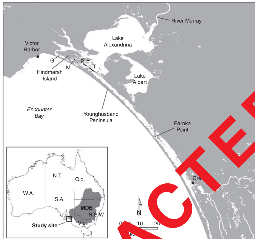
Fig. 1. Lake Alexandrina is a large terminal lake at the mouth of the River Murray, South Australia. Letters mark the locations of barrages.

ecological health (e.g. Jones et al. 2002). The South Australian Government argued for the allocation of large volumes of water to retain the lower lakes in a freshwater state. This was advocated on the basis of its natural ecological character, not least because that was the condition defined in the listing under Ramsar. This is the default baseline state under the Ramsar Convention in the absence of evidence for prior natural ecological character (Pitcock et al. 2010). The decision to return 2750 GL year -1 to the river, through by-passes and water transfer efficiencies, was made at no small cost, because it was effectively argued that Australia had an international commitment to retaining Lake Alexandrina as a freshwater lake. Federal and State Governments agreed to allocate a further 450 GL where it can be demonstrated that this would accrue no socioeconomic hardship to communities in the Basin (MDBA 2012).