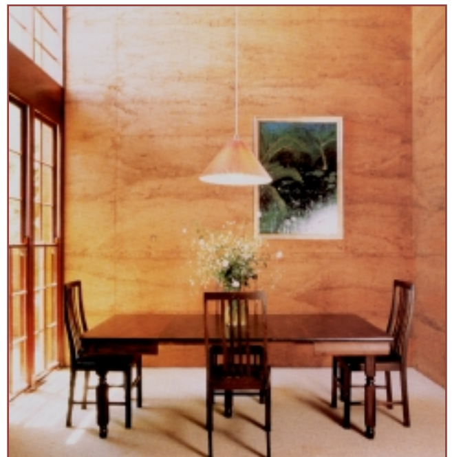
Interior wall of rammed earth