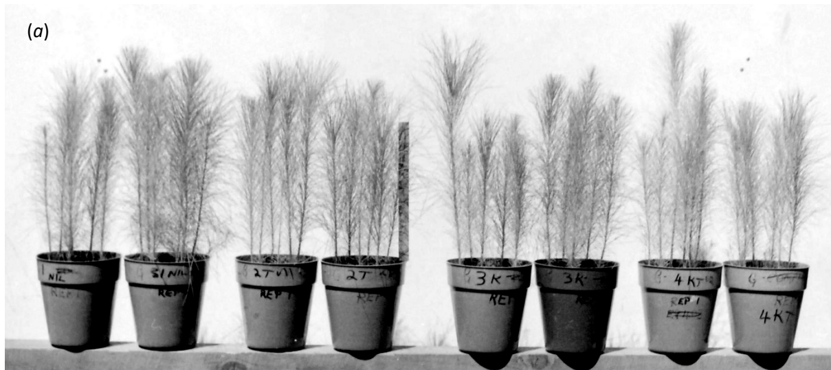
Fig. S2. Glasshouse experiment with Gunn Point(a) soil and two replications of treatments K_0T_0 , K_0T_1 , K_1T_0 and K_1T_1 left to right with; (a) P basal, (b) N + P basal, (c) S + P basal, and (d) N + S + P basal. The scale was a 31 cm ruler