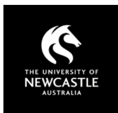
Science and Information Technology