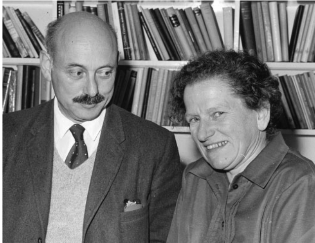
Figure 1. Bernhard Neumann and his first wife Hanna, around the time of Hanna's appointment as professor at the Australian National University, Canberra, 1964.