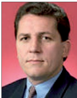
Senator Chris Evans Leader of the Opposition in the Senate, Shadow Minister for National Development, Resources and Energy