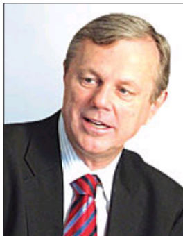
The Hon Mike Rann, Premier of South Australia