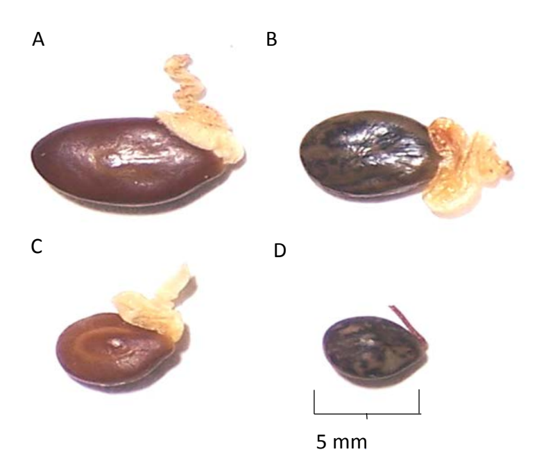
Figure S3. Seeds of four species of Acacia (A – A. aptaneura , B – A. kempeana , C – A. melleodora , D – A. maitlandii ) used in removal, decay and germination experiments.