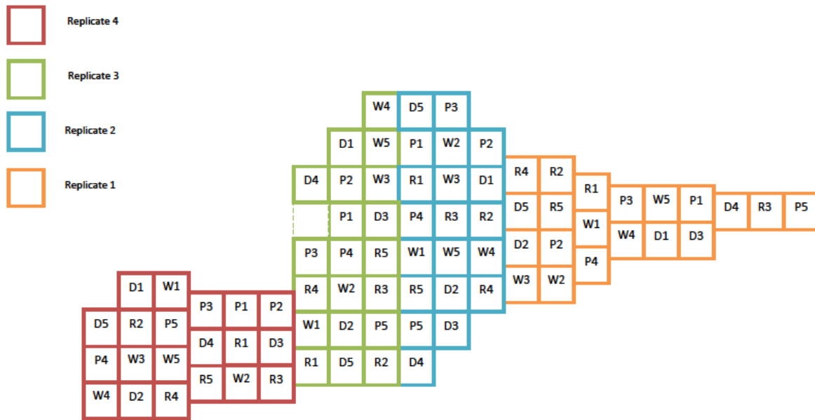
Fig. S1. Randomised block design of the Australian Forest Evenness Experiment (AFEX) in the Styx Valley, Tasmania. The 20 treatments are replicated four times within the site. Letters code for target dominant species (R, Eucalyptus regnans ; D, E. delegatensis ; W, Acacia dealbata ('silver wattle'); P, Pomaderris apetala ) and numbers code for evenness levels according to Pielou's Index (1 = 0.00; 2 = 0.61; 3 = 0.86; 4 = 0.94; 5 = 1.00).