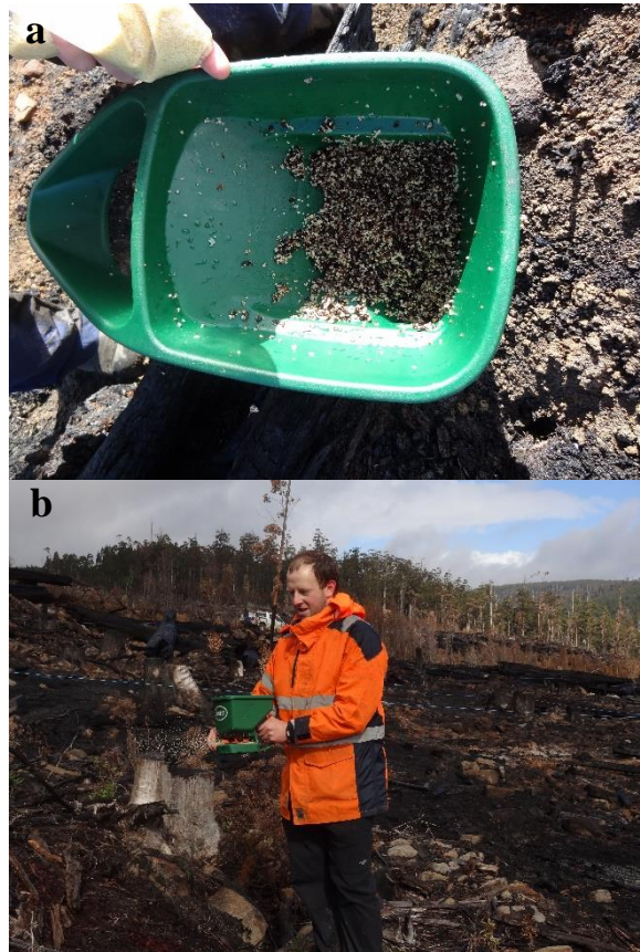
Fig. S2. Sowing method used in Australian Forest Evenness Experiment (AFEX). (a) Handheld fertiliser spreader showing seed mixed with couscous ready for spreading; (b) Dr Tom Baker spreading seed into a plot. The pale couscous flung from the spreader can be seen mid-air.