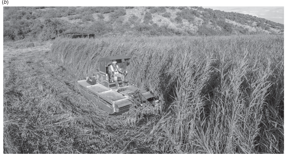
Fig. 3. (a) Grazing by a herd of water buffaloes Bubalus bubalis was used in combination with conventional mowers between 1998 and 2008 to control expansion of the common reed Phragmites australis in the Greek part of Lesser Prespa Lake. (Photograph courtesy of L. Nikolaou, SPP Archive.) (b) Later, mowing in deeper parts was carried out by an amphibian machine. (Photograph courtesy of F. Marquez, SPP Archive).

Various cultural and socioeconomic changes had led to the gradual abandonment of traditional human activities, such as reed cutting and grazing around the lakeshore, which resulted in dense reed beds closing up the areas with open shallow waters (Catsadorakis and Malakou 1997). In order to tackle the resultant loss of biodiversity, a new management scheme needed to be organised, which would operate within the framework of a multilevel and multifaceted approach that incorporated adaptability and flexibility. Hence, the SPP framed its conservation actions around wetland vegetation management and water management while also promoting