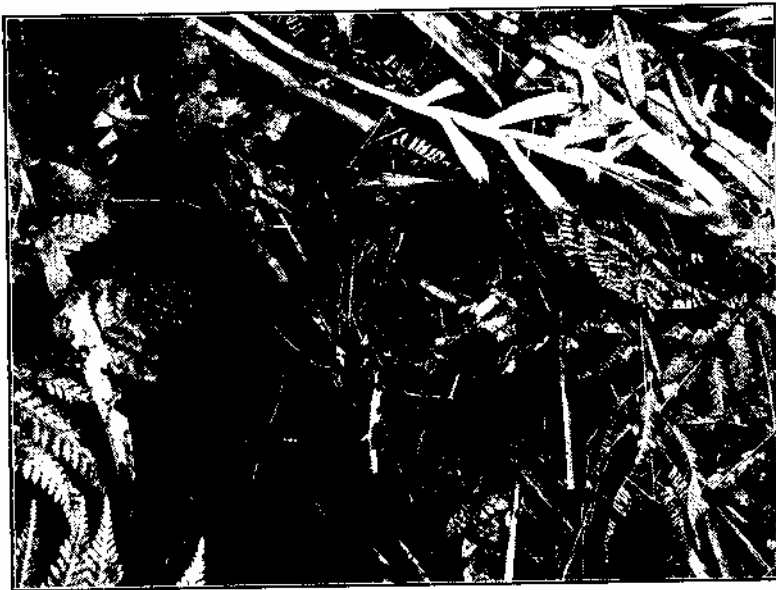
Nest of Atrichornis (Scrub-Bird) on bank of creek.