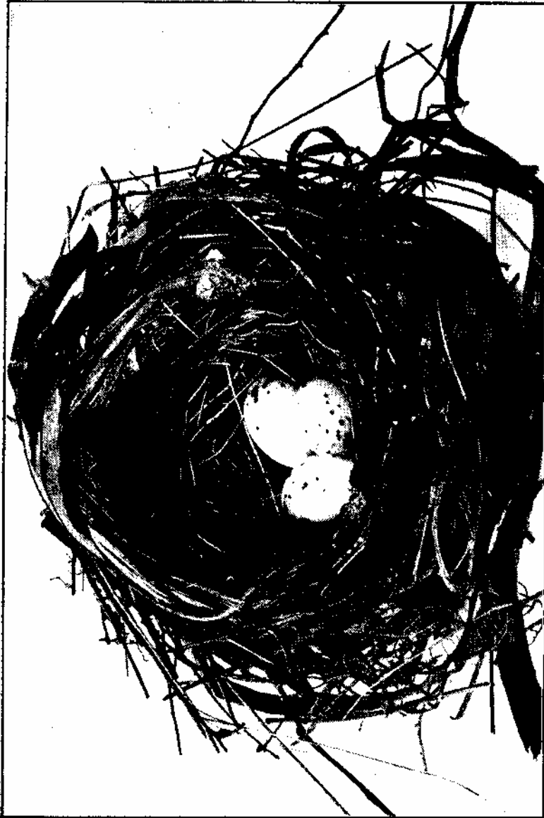
Nest of Northern Olive Thickhead ( Pachycephala v. macphersonianus ).