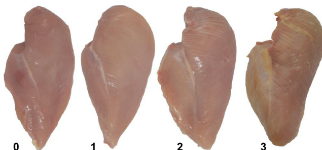
Fig. 2. Modified visual scoring scale for white striping in breast fillets: 0 = normal, 1 = moderate, 2 = severe, and 3 = extreme. Normal, no distinct white lines; moderate, small white lines, generally <1 mm thick, but apparent on the fillet surface; severe, large white lines (1–2 mm thick) very visible on the fillet surface; extreme, thick white bands (>2 mm thickness) covering almost entire surface of the fillet. Adapted from Kuttappan et al. (2016).

As expected, the barley used in this study had less starch (47.1%) than wheat (54.6%) and lower AME (11.92 vs 13.39 MJ/kg, NIR predictions). Thus, increasing barley inclusion decreased ST/CP ratio, and increased the calculated NE of the corresponding diets due to higher supplemental oil. FCR values, except for the starter period, were positively ( P < 0.05 ) correlated with ST/CP ratios. There were also negative ( P < 0.05 ) correlations between FCR values and dietary NE in grower, finisher and the entire production (Days 1–42) period (Table 12).