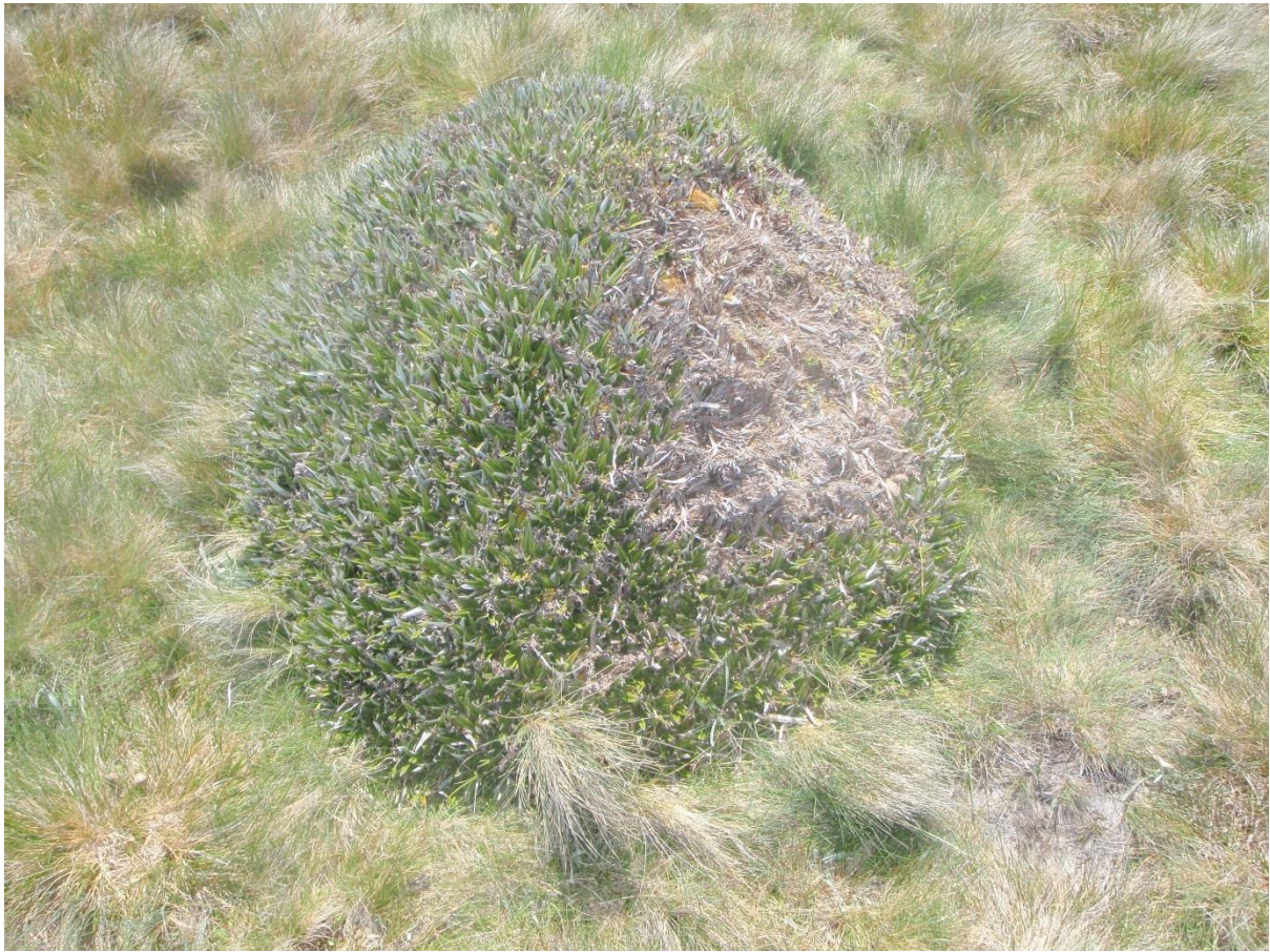
Figure S2. Astelia alpina mound disrupted on its south aspect by freezing in July 2017 and photographed in December 2017.