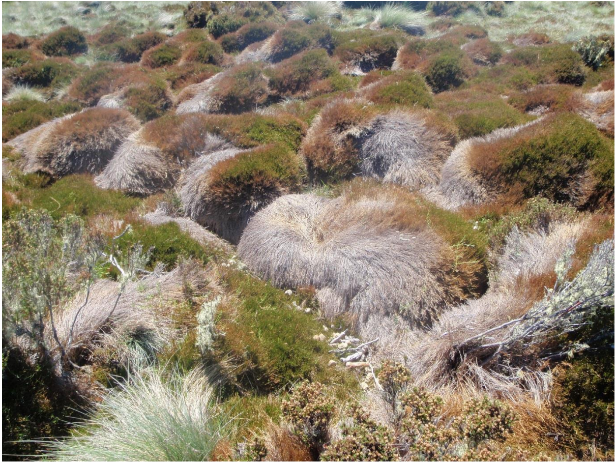
Figure S3. Suffocating billows of Empodisma , senescing to the southwest.