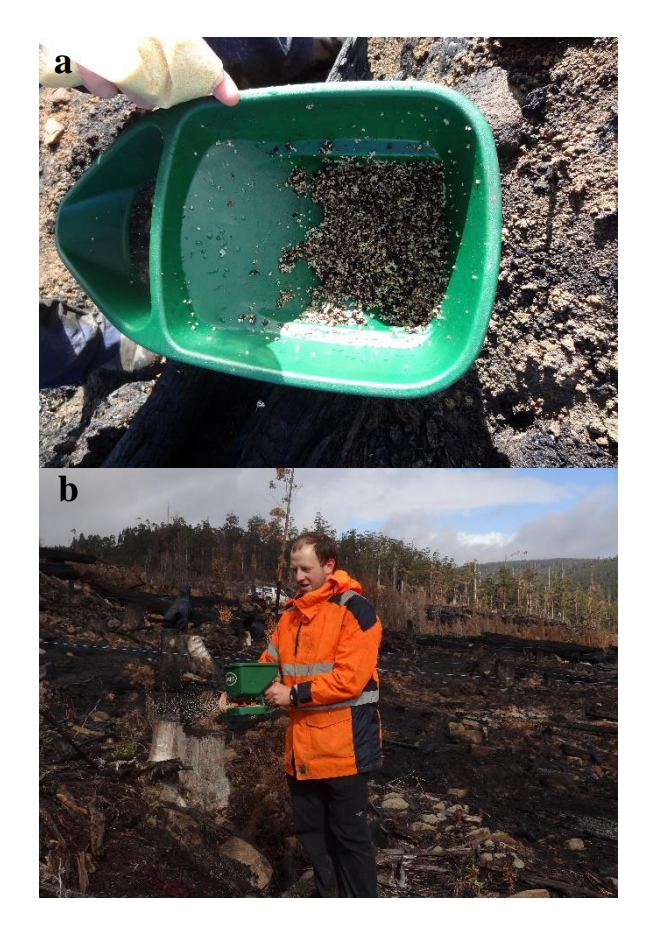
Fig. S2 . Sowing method used in Australian Forest Evenness Experiment (AFEX). (a) Handheld fertiliser spreader showing seed mixed with couscous ready for spreading; (b) Dr Tom Baker spreading seed into a plot. The pale couscous flung from the spreader can be seen mid-air.