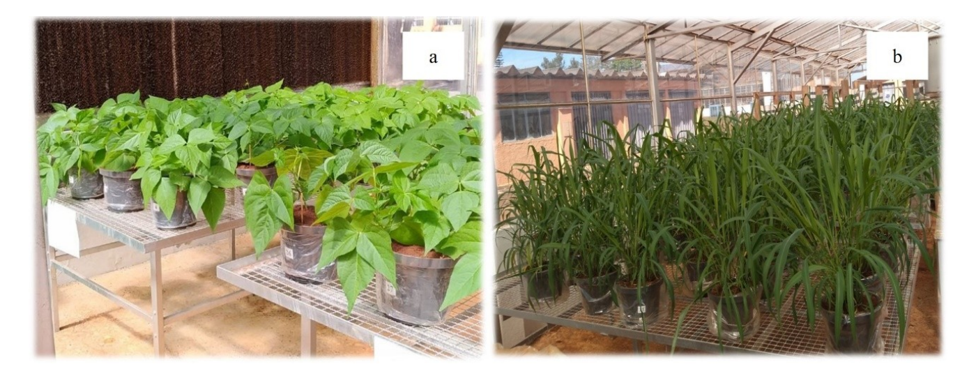
Fig. S2. Photos showing the studied plants in the greenhouse. a) Common bean plants ( Phaseolus vulgaris L. - cv. FC104/EMBRAPA; b) Mombaça grass plants ( Panicum maximum - cv. Mombaça).