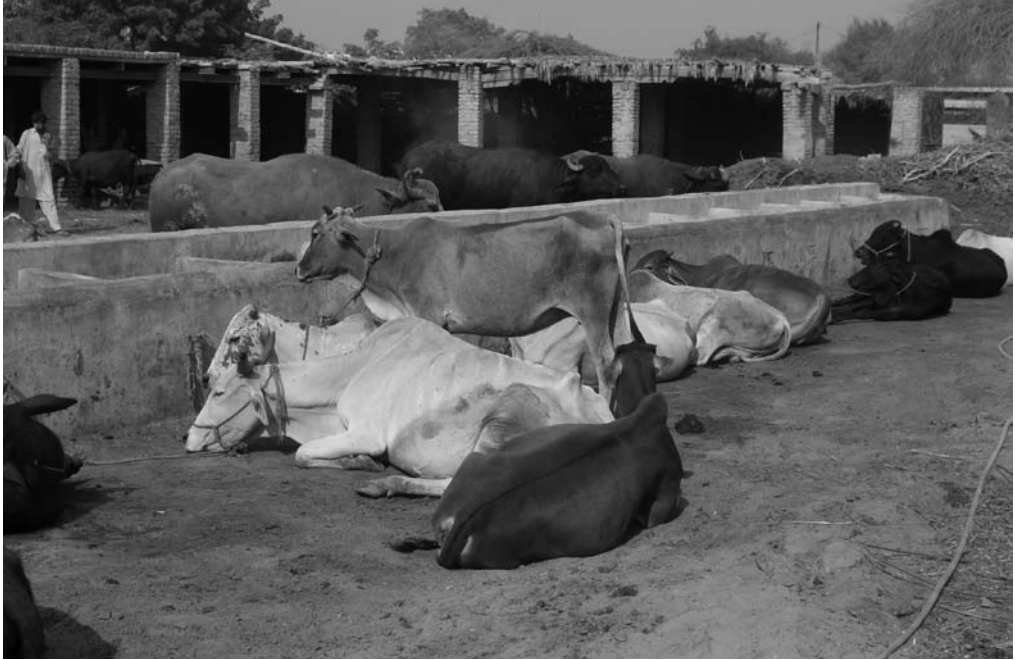
Tethering of stock in the sun can become an animal welfare issue (Pakistan).

health. Sheds should provide a minimum loafing area of 3 m 2 per cow with at least 3 m between rows of cubicles.