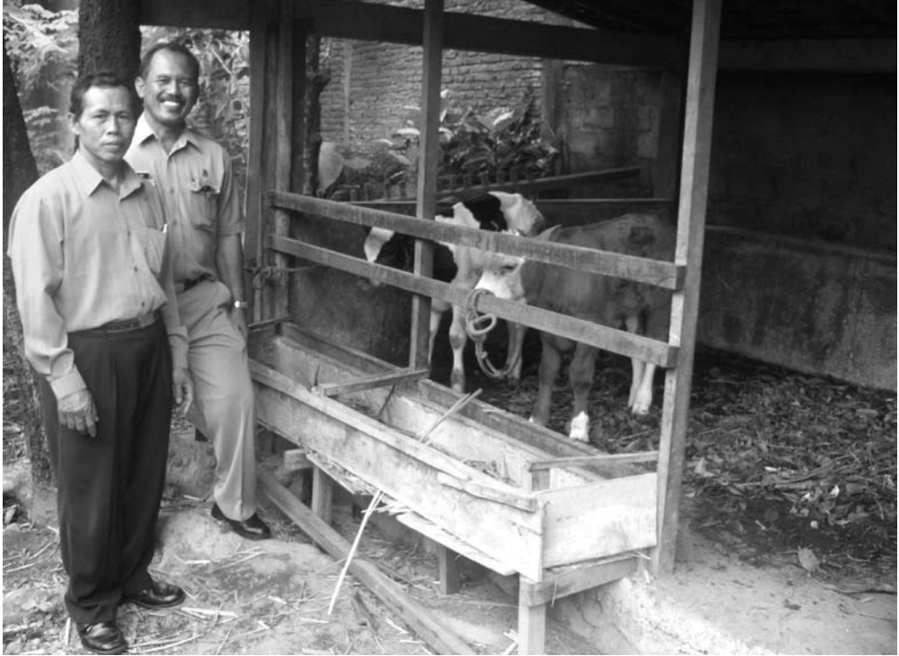
Workshop participants assessing the farmer's facilities for milk rearing his dairy heifer replacements.